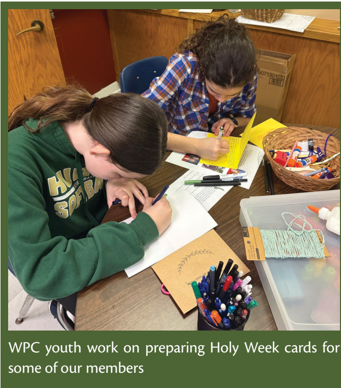
WPC youth work on preparing Holy Week cards for some of our members

Please note that there will not be a game night in April. We'll be back again in May!